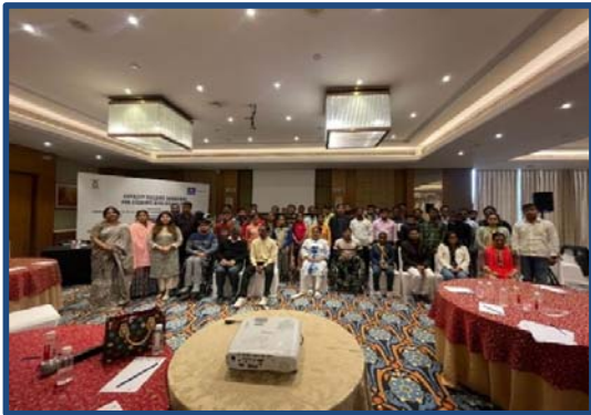
Group photo of workshop held in Lucknow

Lucknow, November 28, 2024 – The National Association for the Blind (NAB), Delhi was proud to join hands with NCPEDP and Bajaj Finserv CSR in conducting a impactful capacity-building workshop as part of the NCPEDP-Bajaj Finserv Scholarship Program. The event aimed to empower students with disabilities by equipping them with the skills and confidence necessary for personal and academic success.