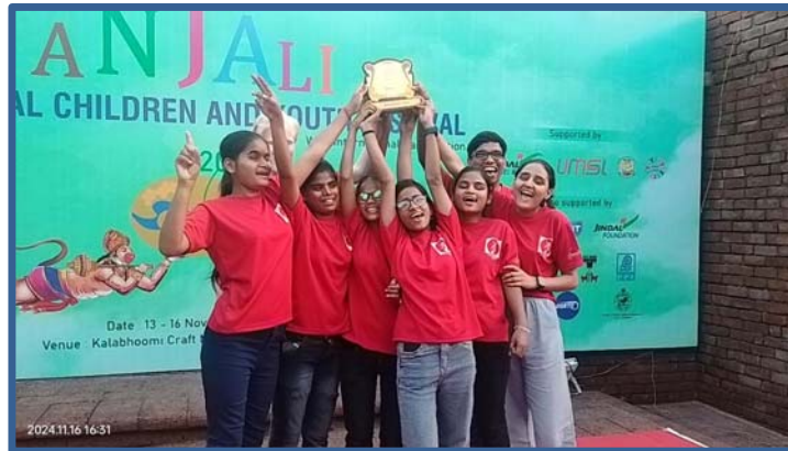
Young students of NAB Delhi with their trophy

Our students proudly participated in the Anjali National Children and Youth Festival 2024, organized by Swabhiman (State Disability Information and Resource Centre) in Odisha. They showcased their talents in group songs, solo performances, dance, games, poem recitation, and workshops—winning prizes and making us proud.