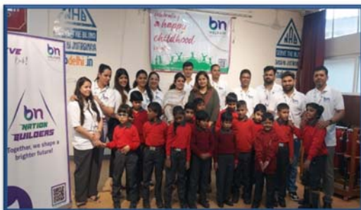
Group photo of BN Group with the student of NAB, Delhi

On Saturday, 16th November, the students of the National Association for the Blind had a delightful Children's Day celebration with the employees of Bristlecone . The Bristlecone team spent quality time with the children, bringing joy and laughter to the occasion. They engaged the students in fun activities, interactive sessions, and shared delicious treats, making the day truly memorable for everyone involved.