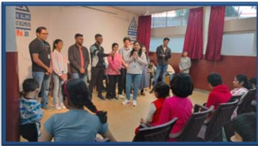
Employees of Bristlecone interacting with the student of NAB, Delhi

On Saturday, 16th November, the students of the National Association for the Blind had a delightful Children's Day celebration with the employees of Bristlecone . The Bristlecone team spent quality time with the children, bringing joy and laughter to the occasion. They engaged the students in fun activities, interactive sessions, and shared delicious treats, making the day truly memorable for everyone involved.